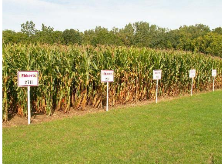
Seed Corn Hybrid Testing in Field Trial

We know and agree with University specialists that ‘spoon feeding’ our row crops do the best job of your crops gaining their yield potentials. Early season loading of 200-300 lbs of N has many negative points that can cause root burn, leaching losses, drying out of the soil, and harming of the soil microbial life and earthworms. Timing in many growers minds leads them to thinking I have to apply the load of my N via anhydrous or urea-based N products prior to seeding because side-dressing is not for me. Any loss 20% or more of the anhydrous ammonia places the grower even with the pricing of liquid products. Anhydrous will desiccate (dryout) soils (when application rates exceed 150 units) within the ball or zone of the applicators exit tube behind the shank or coulter. If the soils are dry and leave cracks when applying anhydrous a loss of >20% is for certain. If the ground is dry, rolling terrain and the applicator is not parallel linked losses of >20% is a strong possibility. If the soils are too warm (>50° F.) losses are certain to occur, high moisture condition soils and subsequent rain or snowmelt will enhance leaching and that is a loss. So you see the optimal chance for anhydrous to minimize losses is not so great. Yes, some of you say I am getting great use and benefits from my application of anhydrous – that is great.