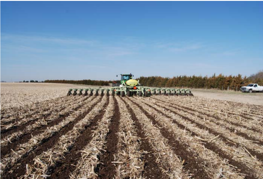
Orthman 14RIPr Strip-Till Tool Giving a Clean and Solid Seedbed - 2009

Did your approach to 2009 give you the best seedbed possible for those soybeans, corn, sunflowers, grain sorghum, dry edibles, sugar beets, cotton, ground nut crops, and or veggies? The question that follows, did your plants have the right soil medium to begin with? Hopefully it was not cloddy, no pockets of air or dang few, little to no residue mixed into the seedbed where you placed your seeds – right? As a tillage company we agree that must be a primary goal of all farmers this day and age. Seed costs, tech fees, soil moisture conditions are critical, fertilizers, pre-emerge herbicides – they all rattle the cage of how you get the ground ready. The technology of the stacked corn and soybean varieties are superior to what we had in the past, but they must get a right start to succeed and give you the potential yield that you to seek. We encourage you to use strip-till equipment to till, help manage any soil compaction within the upper 12 inches of the soil surface and place some quality fertilizers that will promote early development for a good send-off into the cropping season of